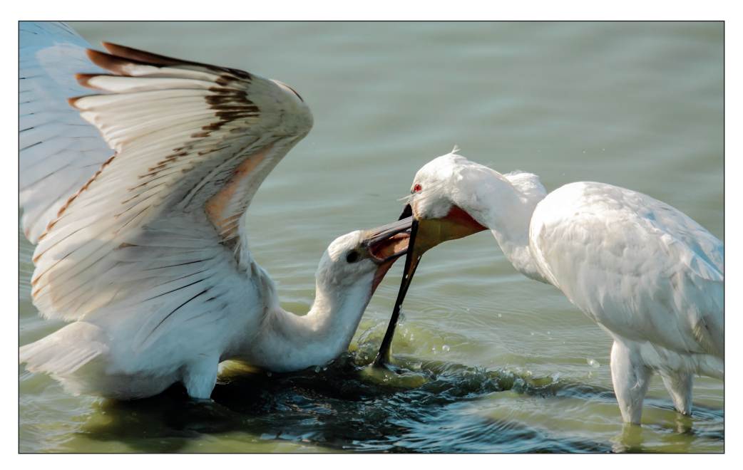
Figure 1. An adult Spoonbill is feeding its fledged offspring. Note that the young insert its bill into the throat of the adult to get the regurgitated food

1. ábra Öreg kanalasgém eteti a kirepült fiókáját. A fiatal a csőrét a szülő torkába dugja, hogy megszerezze a visszaöklendezett táplálékot